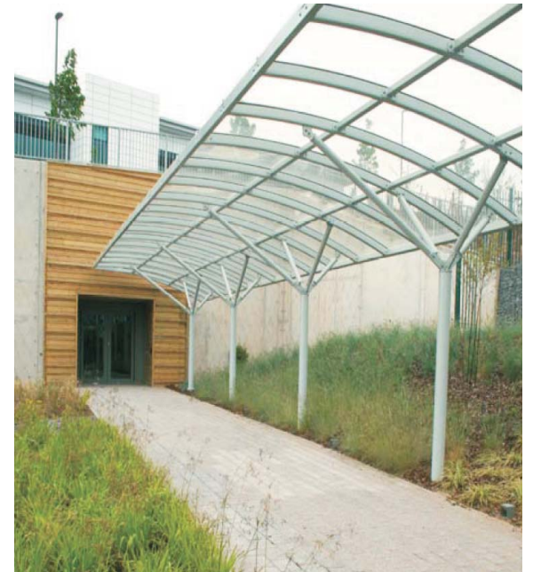
Figure 2 Benchmarking